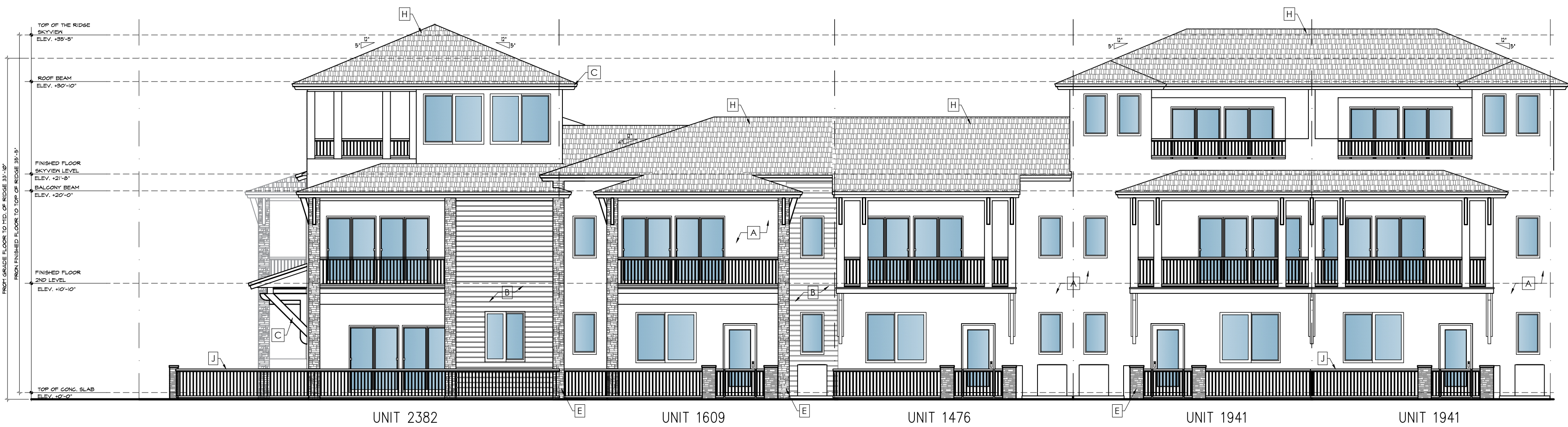
10 UNIT BUILDING L SHAPE - FRONT ELEVATION